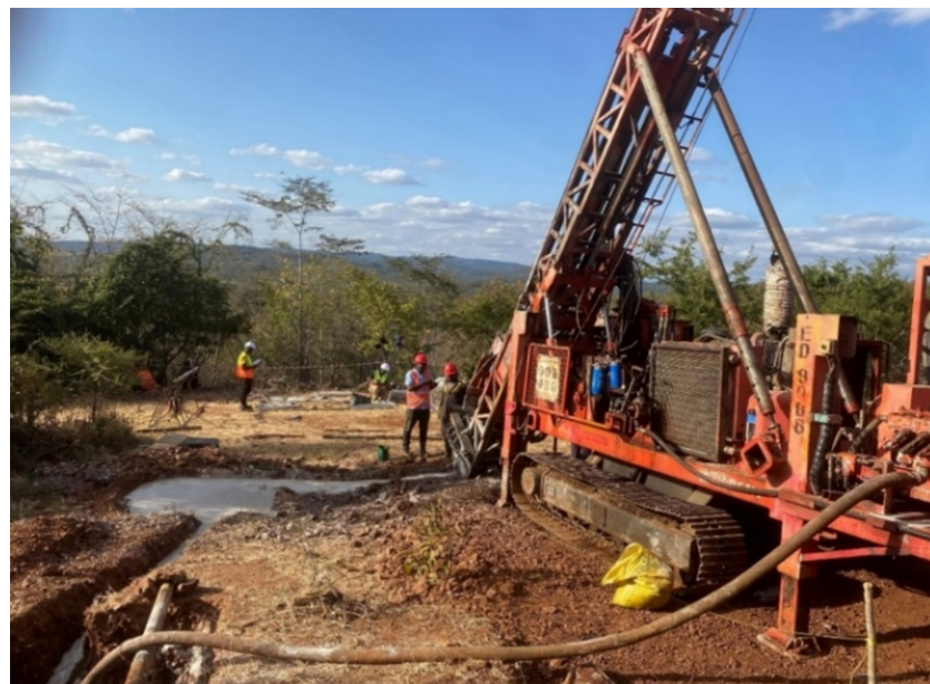
Figure 2: Drilling has commenced at the first drill target

Drilling of the first of the intended target holes (CDD004) as per Figure 2 below has been completed, with an intersection of pegmatite in evidence from 6 m to 14.45 m ( \pm 8.45 m, not true width), close to outcropping pegmatite. Sample coring ceased at 26.3m.